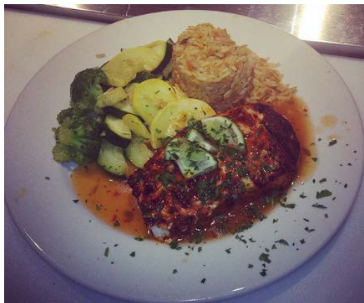
Cajun Sea bass

Pump Station Prize Pack filled with Pump Station swag, including a gift card and a free growler fill. The winner will be announced in our next newsletter on February 12, 2015.